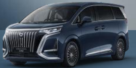
Whale Sea Blue