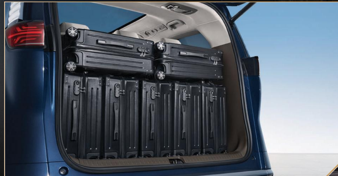
Electric Trunk with Position Memory and Anti Pinch

The enormous 410L to 570L trunk (fits up to 7 large suitcases) can accommodate any lifestyle need. With enough room for a large air bed, the DENZA D9 takes luxury road trips to the next level.