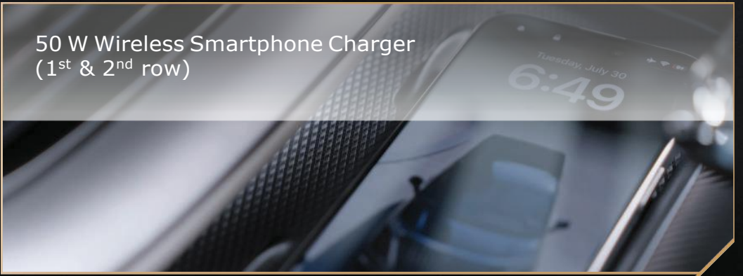
50 W Wireless Smartphone Charger (1 st & 2 nd row)

Multi-color Ambient Lighting | 15.6 Inch Head Unit with Voice Control "Hi DENZA" | Three Zone Independently A/C