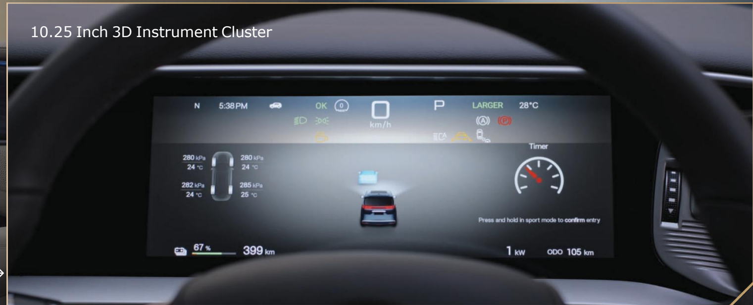
10.25 Inch 3D Instrument Cluster